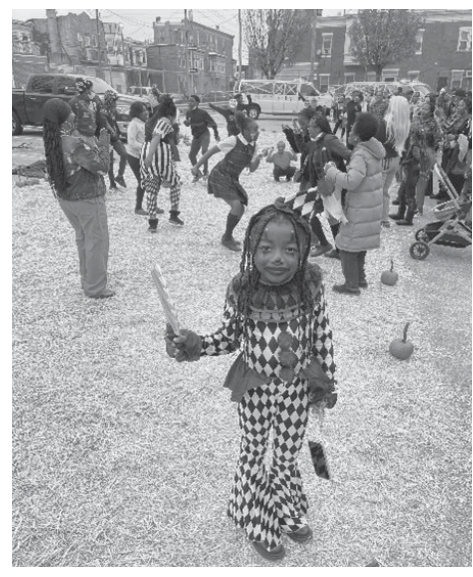
We had a great time with creative costumes and music, spent the night dancing and just having a good time, while providing state government-related services to those who need it. Who says you can't have a good time at work?!