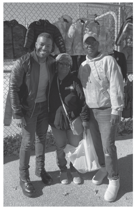
We made sure hundreds of children from all ages got free coats.