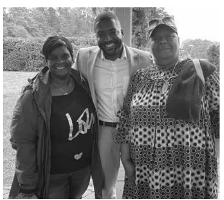
Meeting with victims of gun violence - these two women lost loved ones.