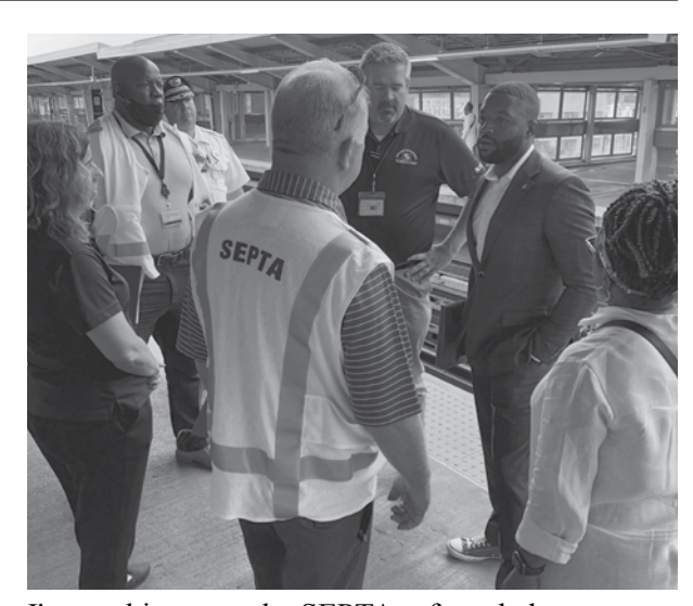
I'm working to make SEPTA safe and clean.

This year, I introduced a Mobile District Office, and it has been a huge success! The mobile office has everything we need to help you access state government-related services, and you can even ask us to come to you!