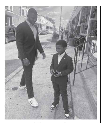
I was out doing constituent services work with my team when we ran into this young man who said he liked my suit. So, I went and bought him one just like mine! We have to be the best possible role models for our future leaders!