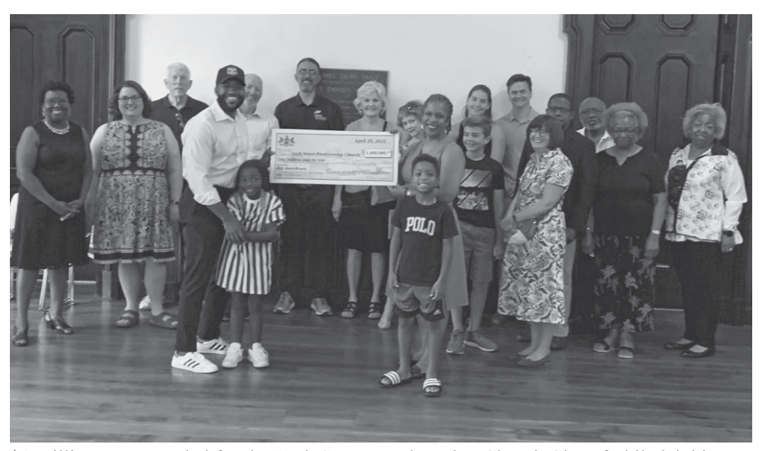
$1 million was awarded for the Arch Street Presbyterian Church City of Philadelphia.