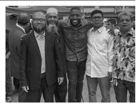
We are working to support all ethnic groups in every community.